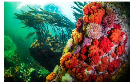
Ecologically significant areas in the Great Bear Sea.

As a signatory to the Convention on Biological Diversity, Canada is striving to achieve the ambitious goal of 10% coverage of coastal and marine areas in networks of marine protected areas (MPAs) by 2020. Key points to ensure that MPA networks are effective and successful are summarized below: