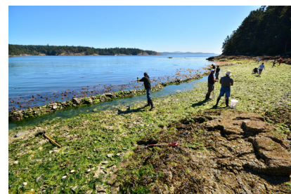
Coast Salish clam garden in Gulf Islands National Park Reserve.